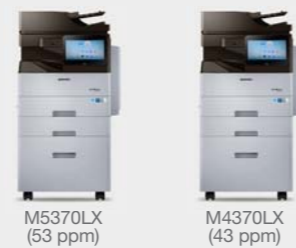
M5370LX (53 ppm)