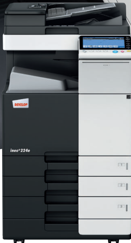
ineo+ 224e with paper feeder (PC-210) and dual scan document feeder (DF-701)