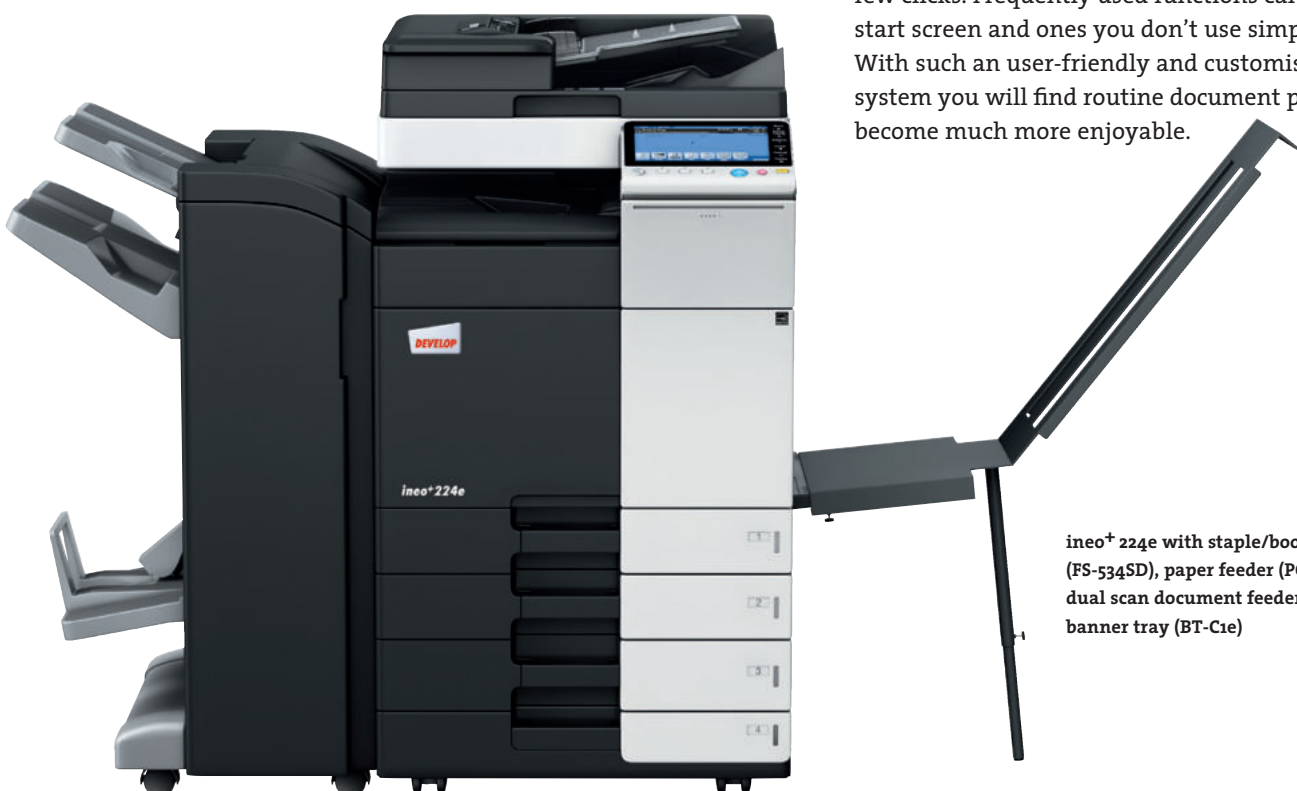
ineo+ 224e with staple/booklet finisher (FS-534SD), paper feeder (PC-210), dual scan document feeder (DF-701), banner tray (BT-C1e)

Many multifunctional office systems are anything but user-friendly. The ineo+ 224e, in contrast, is simplicity itself. An intuitive, easily understandable operating concept ensures that it is as easy to use as your smartphone or tablet. The 9-inch capacitive touchscreen comes with familiar multi-touch operations such as flick, drag&drop and pinch in&out – so you will feel at home in this system in no time at all. Thanks to a new menu navigation structure you can see all functions in one go and select the settings you want with just a few clicks. Frequently used functions can be left on the start screen and ones you don't use simply removed. With such a user-friendly and customisable office system you will find routine document production jobs become much more enjoyable.