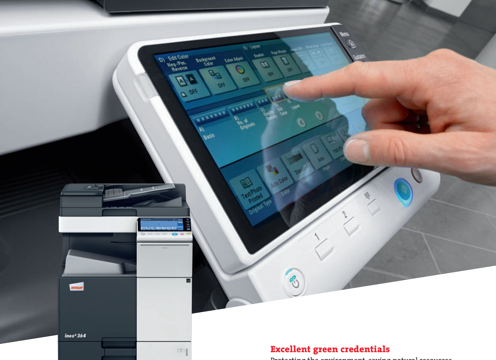
ineo<sup>+</sup> 364 with paper feeder (PC-110) and dual scan document feeder (DF-701)